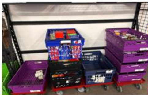
Our stock now

Would you be able to ask your pupils to bring in one tin to support us throughout September? If everyone participated, then we feel the target is reachable.