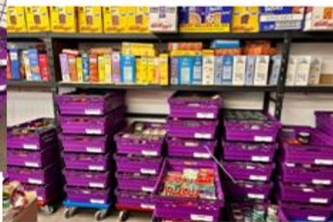
Our stock last year

Thank you for your support over the past years. We couldn't do what we do without your help.